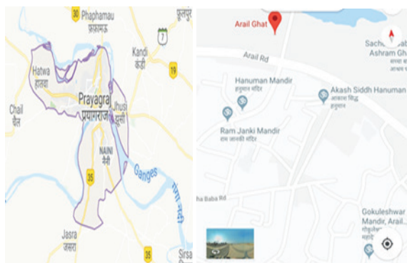
Figure-1 shows map of studied area.

Study area is situated in the southern part of Uttar Pradesh in the Prayagraj (Allahabad) district (fig.1). People living near Arail Ghat mostly depend on the river water for drinking purpose because most of the people's occupation is boat sailing and they do not carry water bottle with themselves, also because of spiritual believes that Ganga/Yamuna river water is the purest whereas as people living far from the river consume regular government tap water for drinking purpose.