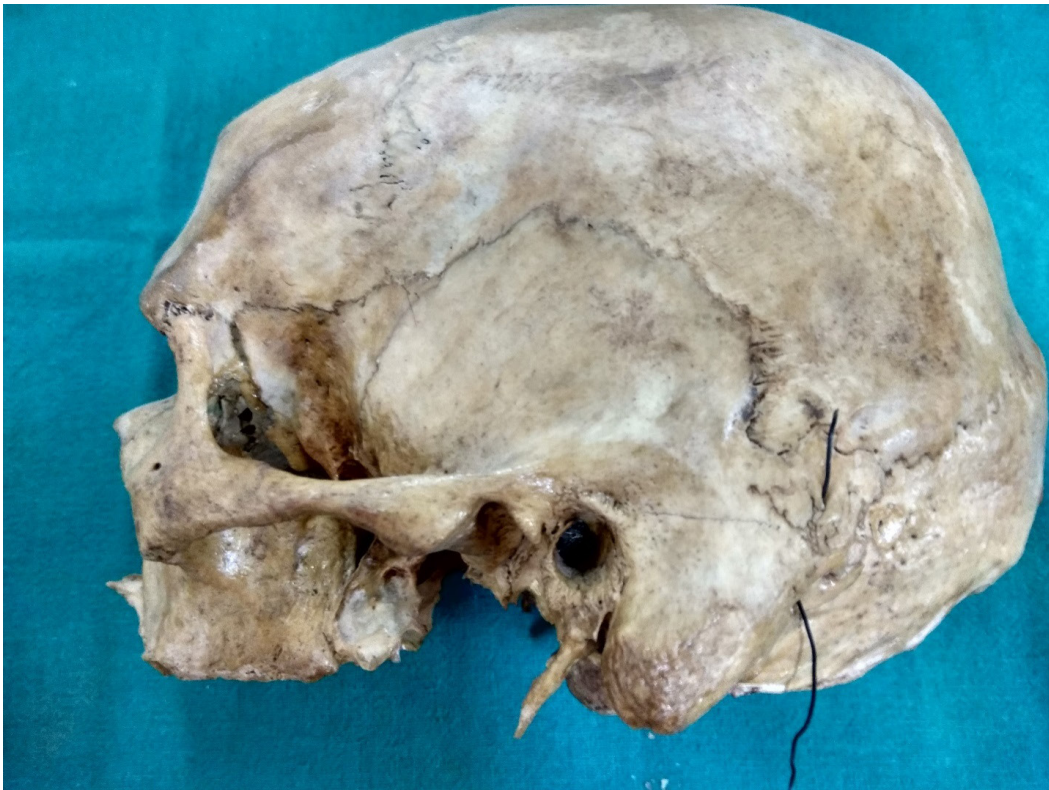
Figure 1: Wire passing through mastoid canal