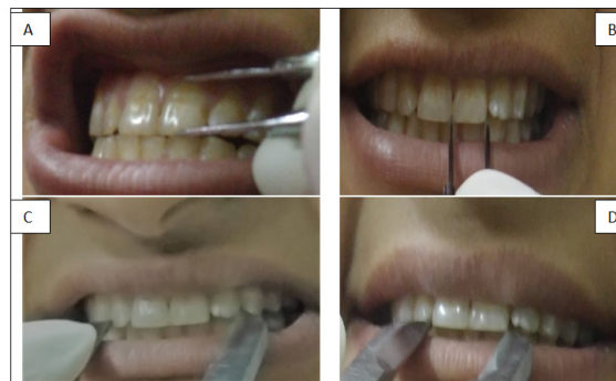
Figure 1: Showing the odontometric parameters used in the study