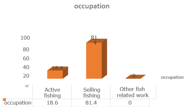
Fig 2: percentage distribution of occupation of fishermen community