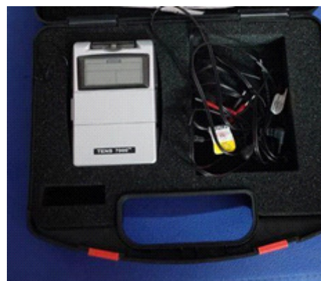
Figure 1: Transcutaneous auricular vagal nerve simulator (Acutens/TENS 7000)

Control group was treated with Epley's maneuver technique: 1 time along with conventional stroke rehabilitation exercises for 6 days/week with a duration of 1 hour every day.